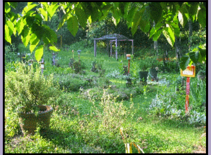
Pictures of the month July, 2007 Top: Early morning in the Big Fragrant Garden For larger photos click here

Early Morning light in the Big Fragrant Garden with Torma. July 2007