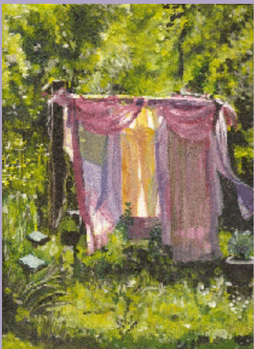
Original art by Myra Bonhage-Hale from photo Bathtub in the Garden #2 © at La Paix Copyright September 2007