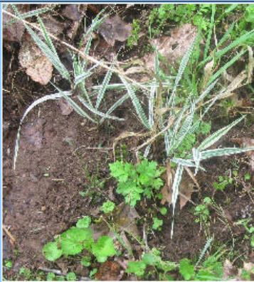
Ribbon Grass, Mugwort, Violets