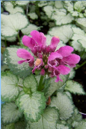
Lamium or Archangel

plants which grow well in full sun. which are drought tolerant and which are hardy.