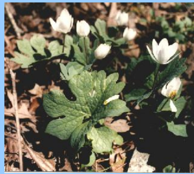
Blood Root or Sanquinaria