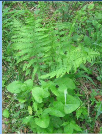
Volunteer Christmas Fern & Violets