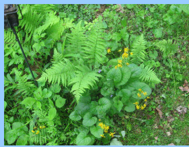
Volunteer Ferns, Violets, Ragwort

plants which grow well in full sun. which are drought tolerant and which are hardy.