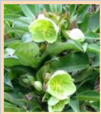
Hellebore or Christmas Rose