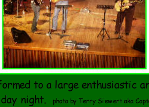
"Public Outcry" performed to a large enthusiastic and evolved audience on Friday night.