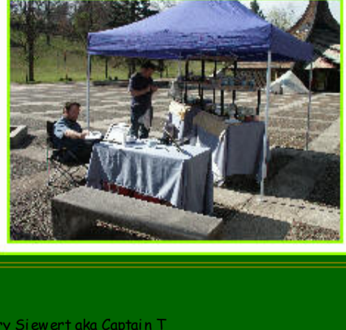
On left: On right: So-Lux Soy Candles